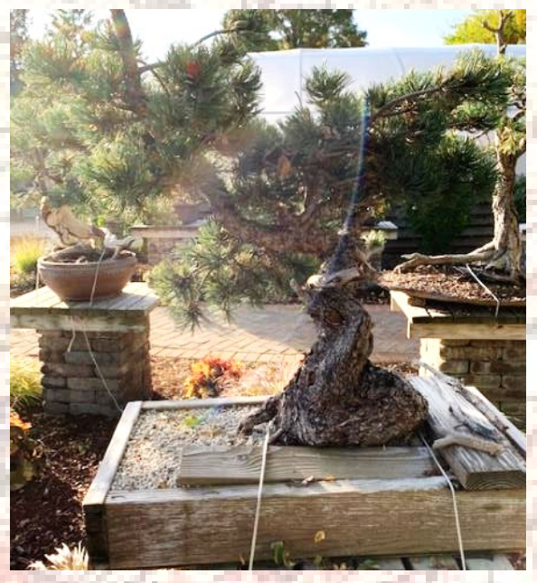
A pine at Hidden Gardens Nursery Chicago