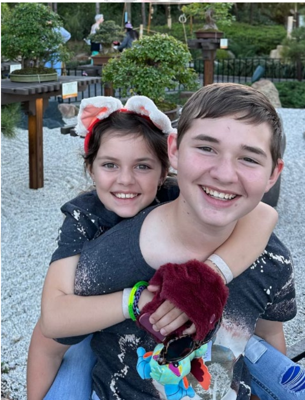
Thanks for reading all the way to the end. Enjoy this picture of my kids posing in front of my tree at Epcot... It's one of my new favorites.