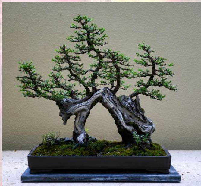
A tree by David De Groot, Pacific Bonsai Museum. Celebrating a more Penjing style in celebration of BSF's new opportunity to Display Penjing at Epcot Flower and Garden 2024. More Details in the newsletter below.