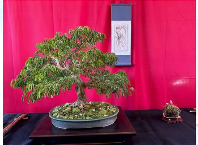
Another Award Winning tree from Joy of Bonsai 2023

We have a couple very exciting events we are working on that we will release more details on in the coming months.