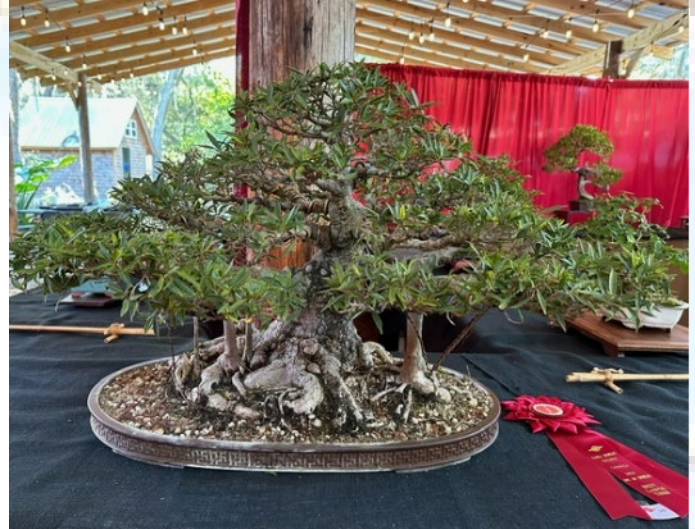
Award Winning tree from Joy of Bonsai 2024

The demos/workshops were great and the exhibit improves every year.