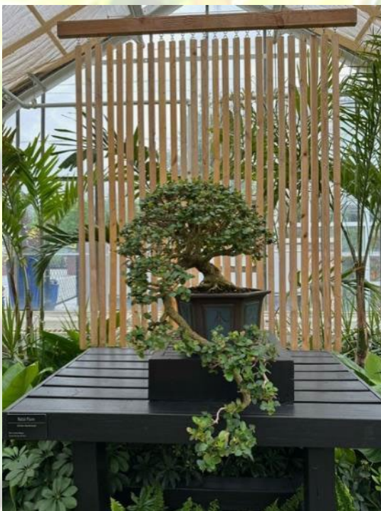
Natal Plum at the Franklin Park Conservatory