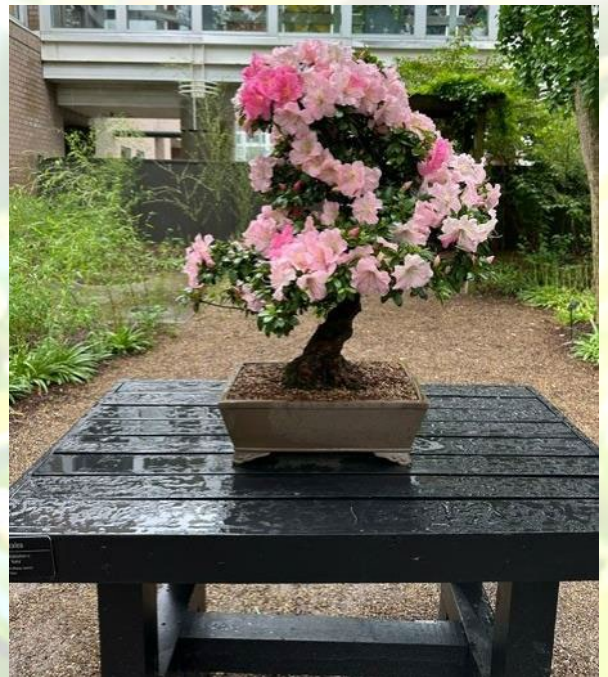
Azalea in full bloom at the Franklin Park Conservatory (Columbus Ohio) bonsai collection. Unfortunately, the conservatory doesn't publicly display the artist that originally created the bonsai.